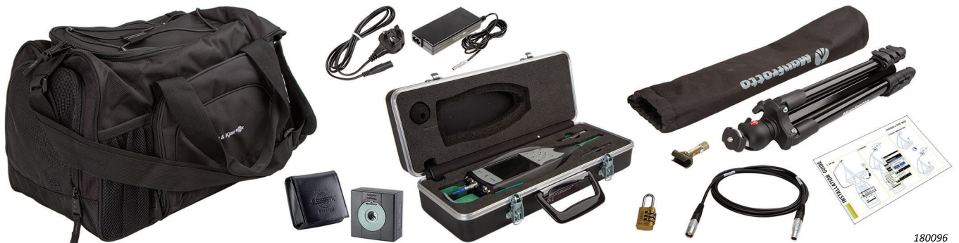
Fig. 1 MATRON 4 Type 3668-L-SC

Note: Firmware for Hand-held Analyzer Types 2250, 2270 and 2250-L is free of charge. Use the Measurement Partner Suite application to install the firmware for MATRON 4 on your analyzer.